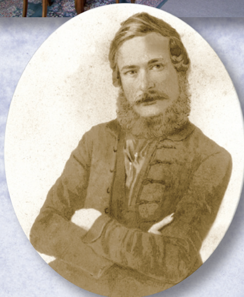
The only one photo of Ludovít Štúr, the photocopy of an original daguerreotype, made in 1884

The very place, where he died in consequence of a tragic accident in Modra. In the museum you can see furniture, screens, writings and photos from the first half of the 19th century.